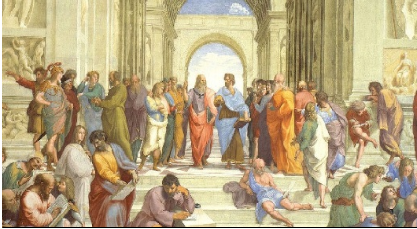
The heavenly Plato points skyward and the pragmatic Aristotle points towards earth. The school of Athens, Raphael circa 1510.