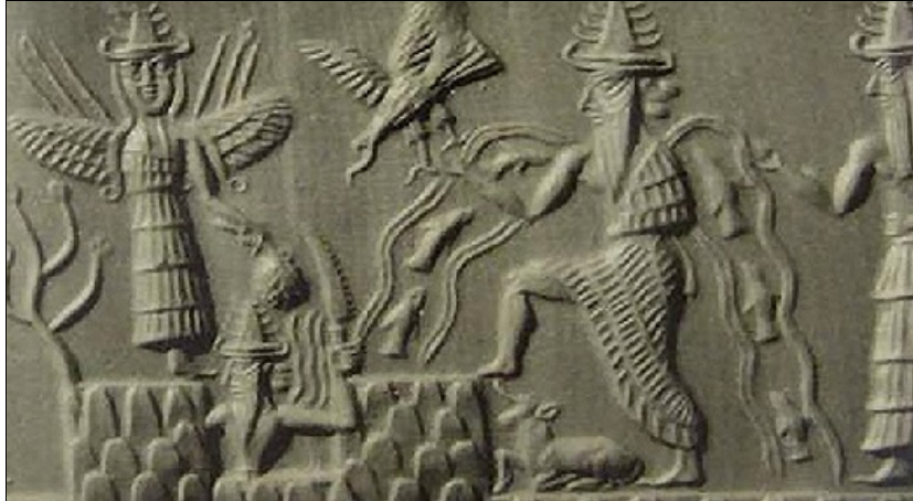
Enki 4) the Great Satan and God of the Abyss, 2 nd millennium bce, Mesopotamia

The Great Satan or the global dominance of the newest religion